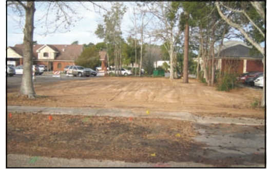
808 Pennsylvania Ave.

The CRA was also accepted to the Florida Main Street program. The program will provide training and technical assistance to our newly formed Lynn Haven Main Street organization in support of our downtown revitalization efforts.