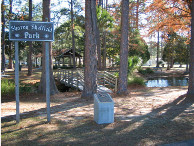
Sharon Sheffield Park

The Community Redevelopment Agency (CRA) was created by the Lynn Haven City Commission on May 25, 2004. Its purpose is to make improvements throughout the designated CRA district through the use of grants, the coordination of public/private investments, and Tax Increment Financing (TIF)