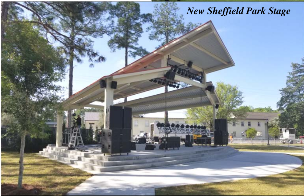
New Sheffield Park Stage